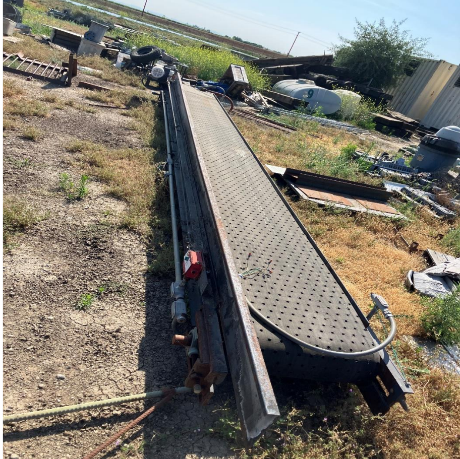
Replaced Elevator – not applicable for use at other sites