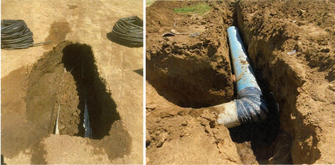
Figure 1. 4,000 Pump Pipeline Leak and Repair

Staff determined the best solution to repair the 54" Bellota Pipeline leak was to install a new manhole 5' downstream of the leak and repair the crack from the inside. By 4/23/21 District staff installed the manhole and repaired the crack. The pipeline was filled and returned to service on 4/26/21, with no visible leaks. Figure 2 shows the leak and Figure 3 shows the repairs. Staff also excavated the other two potential leaks. The other potential leaks were attributed to a private irrigation pipeline and not the Bellota Pipeline, so no additional repairs were necessary.