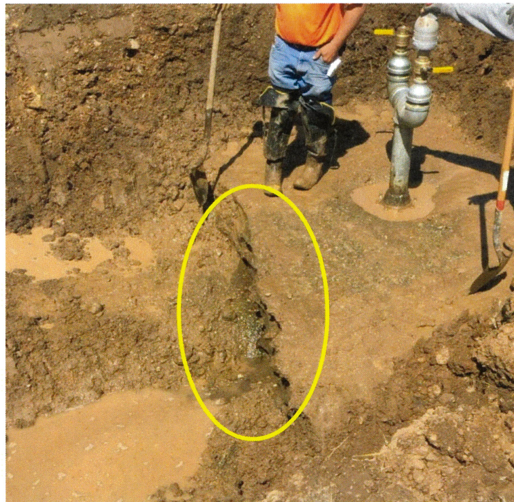
Figure 2. Bellota Pipeline Leak

Staff determined the best solution to repair the 54" Bellota Pipeline leak was to install a new manhole 5' downstream of the leak and repair the crack from the inside. By 4/23/21 District staff installed the manhole and repaired the crack. The pipeline was filled and returned to service on 4/26/21, with no visible leaks. Figure 2 shows the leak and Figure 3 shows the repairs. Staff also excavated the other two potential leaks. The other potential leaks were attributed to a private irrigation pipeline and not the Bellota Pipeline, so no additional repairs were necessary.