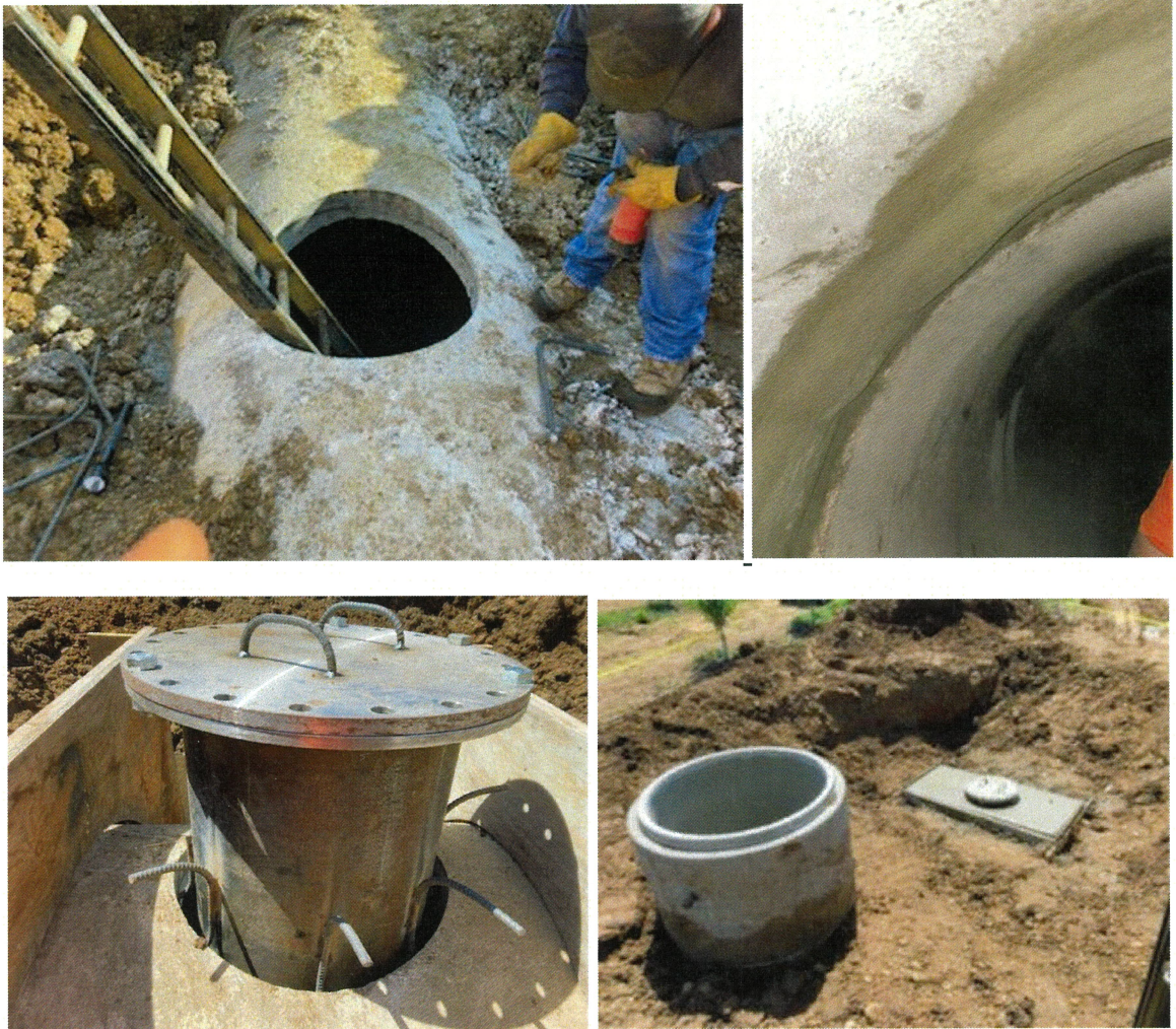
Figure 3. Bellota Pipeline Repair