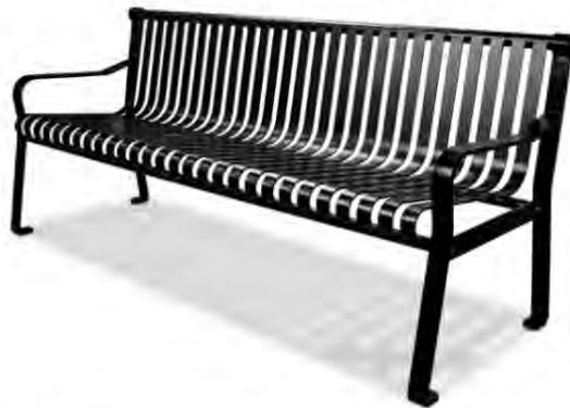
Figure 1. Courtyard Style Bench

The proposed courtyard style bench (Figure 1) is six (6) feet wide, made of metal, provided with a protective coating, and commercial quality. Placement options for the proposed bench include the Administration parking lot, at the entrance to the Administration building, or behind the Administration building and within the pergola area. The proposed courtyard style bench costs between $699 and $1,315, depending on vendor. A separate engraved plate would be purchased and affixed to the bench for a nominal cost.