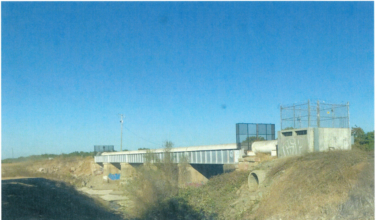
Figure 1. Peters Pipeline 66-inch Outlet Structure

As part of the 2021-2022 budget, the Board authorized $100,000 for the design and construction of an automated flow measurement project at the Peters Pipeline 66-inch Vault Outlet structure (Figure 1), upstream of the Mormon Slough railroad bridge crossing. There is an existing 66-inch manually operated slide gate and a short section of 66-inch reinforced concrete pipe (RCP) discharge pipe. This project is especially important as the District proceeds with the Hosie crossing and other projects. The automated diversion will allow staff to supplement the irrigation flow rate in the Mormon Slough with New Melones water and provide for remote capability to discharge water not suitable for treatment or during an emergency. The project also decreases upstream diversion requirements into Mormon Slough, thereby decreasing flows to be bypassed through upstream construction sites.